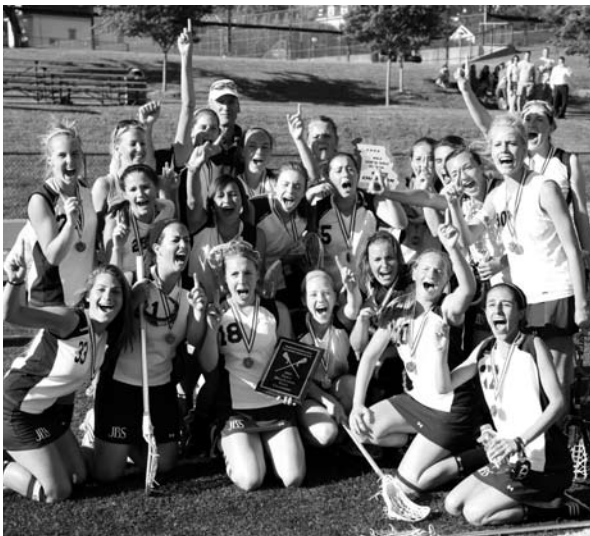
A dream season for the girls' lacrosse team concluded with a 6-4 victory over Nerinx to claim the state title.