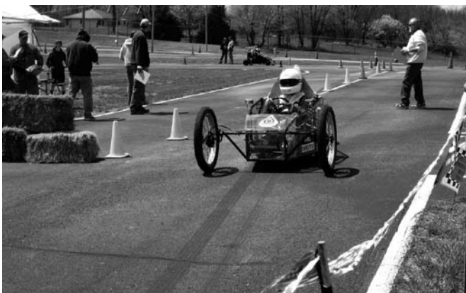
Burroughs' vehicle running on biodiesel fuel completes one of five successful circuits, averaging 150 miles per gallon.