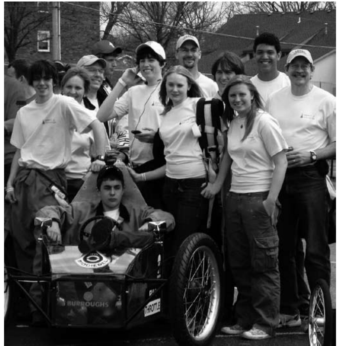
Team members gather around the car on race day.